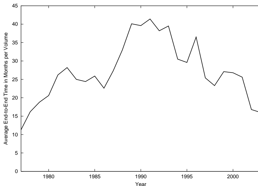
Figure 2: ACM TODS End-to-End Time

and the time for the publisher to copy edit, typeset, proof and print the paper. Figure 2 shows the data for TODS , calculated from the submission date as indicated on the last page of the article in the journal and from the cover month of the issue 3 . This data does not take into account that some issues over the past few years were printed late, nor does it include data for the first volume, as papers in that volume do not have a “submitted on” date.